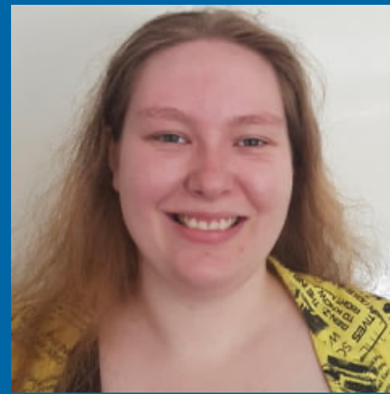
Laurie Youth Council and Young Champions Lead Support Youth Council (Contractor)